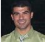
MLAB YMF PRESIDENT