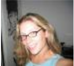
SB/VC YMF PRESIDENT