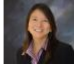
OC YMF PRESIDENT